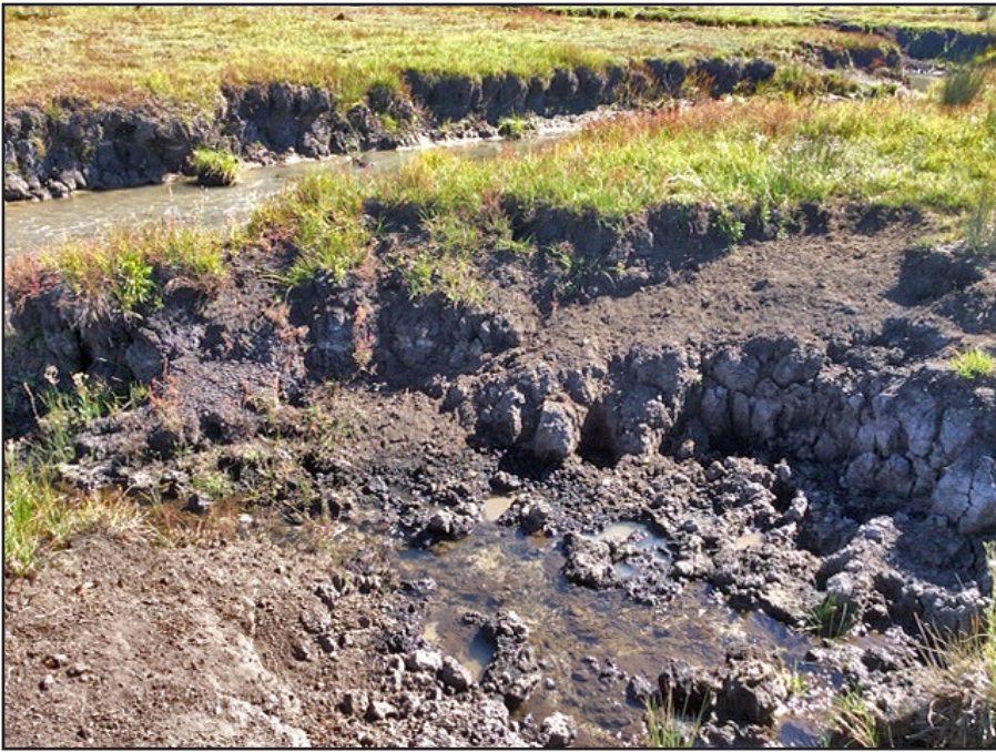
Walking north along Currango Creek, from about 1km above the Causeway (2)