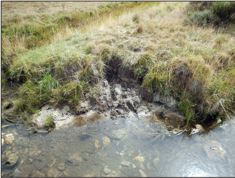
Walking south from the Confluence of Currango Creek and Gurrangorambla Creek