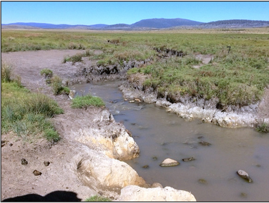
Walking north along Currango Creek, from about 1km above the Causeway (1)